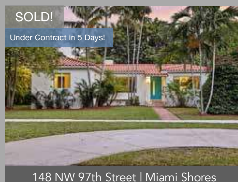
148 NW 97th Street I Miami Shores Sold @ $755,000