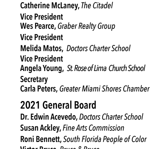
victor bruce, bruce & bruce