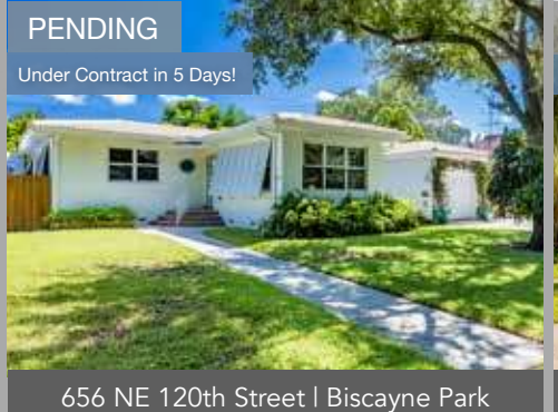
556 NE 120th Street | Biscayne Park Offered @ $749,000