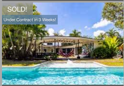
500 NE 96th Street | Miami Shores Sold @ $2,500,000