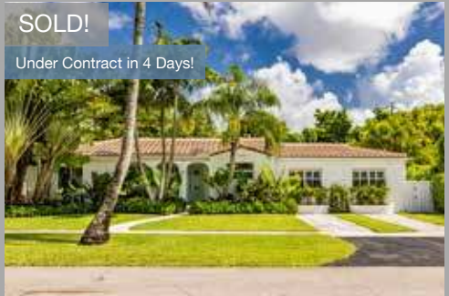
70 NE 99th Street | Miami Shores Sold @ $1,250,000