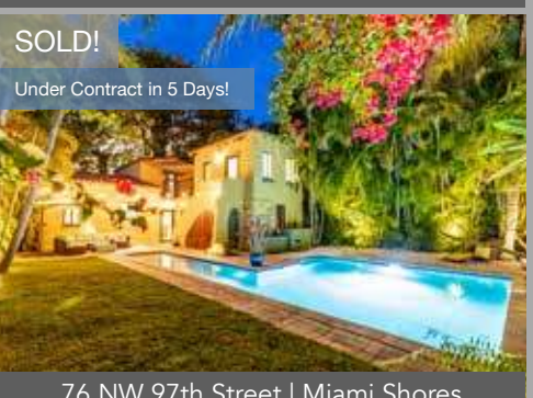
76 NW 97th Street | Miami Shores Sold @ $875,000