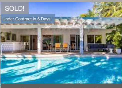
1130 NE 91st Terrace | Miami Shores Sold @ $1,390,000