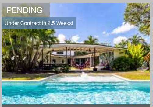
500 NE 96th Street | Miami Shores Offered @ $2,599,000