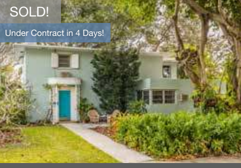
444 NE 102nd Street | Miami Shores Sold @ $645,000