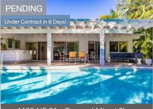
1130 NE 91st Terrace | Miami Shores Offered @ $1,399,000