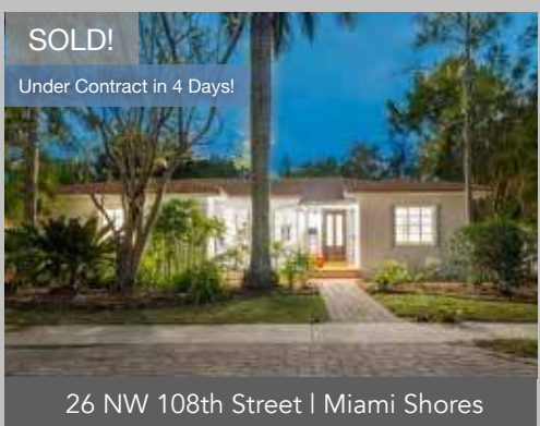
Sold @ $555,000