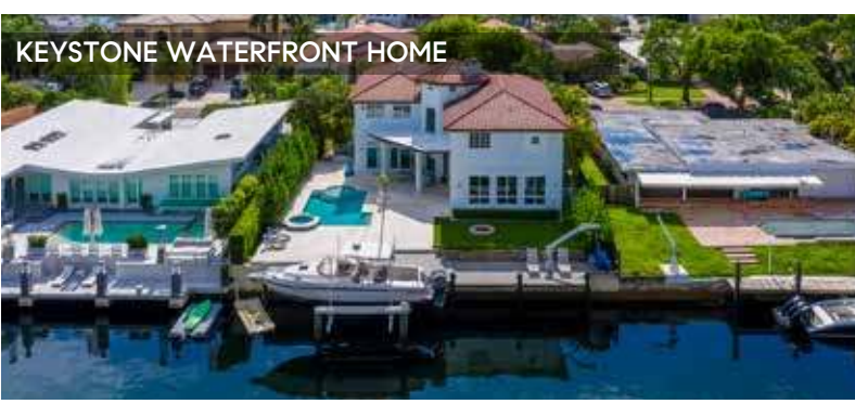
13200 BISCAYNE BAY TERRACE 5 BED · 3 BATH · 4.094 SQFT