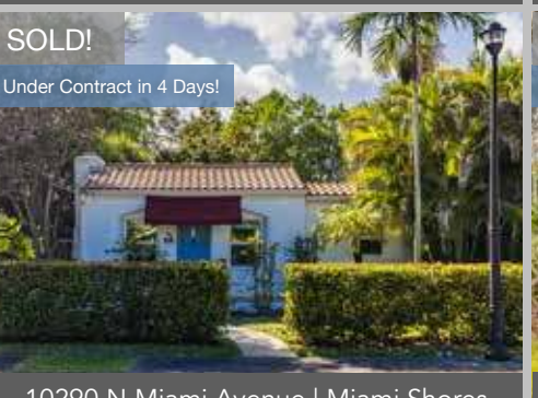
10290 N Miami Avenue | Miami Shores Sold @ $450.000