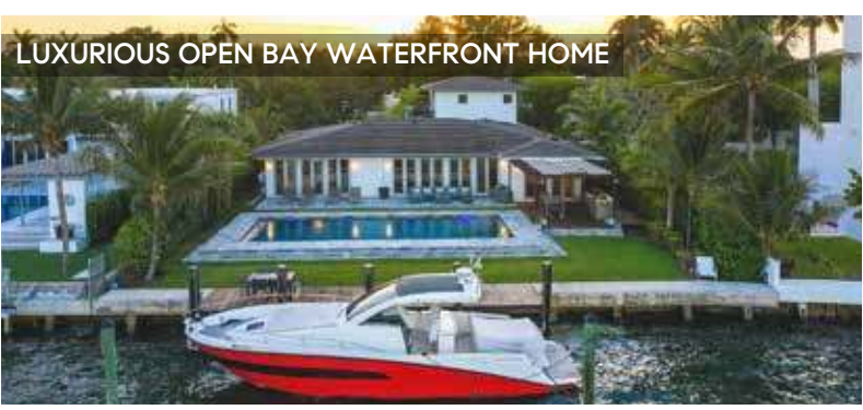
9301 N BAYSHORE DRIVE, MIAMI SHORES 5 BED · 4.5 BATH · 4,225 SQFT