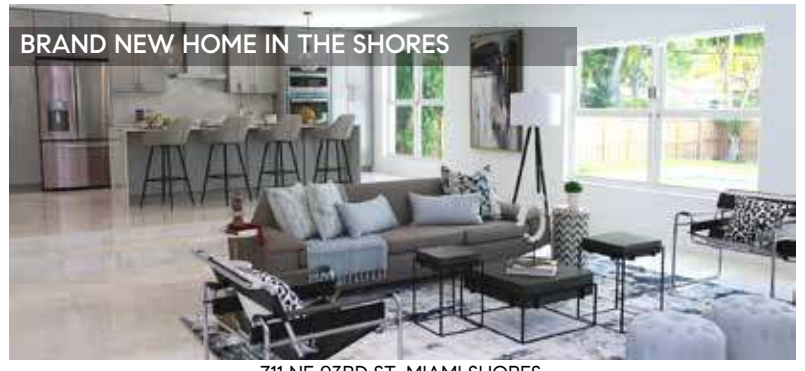
711 NE 93RD ST, MIAMI SHORES 3 BED · 3 BATH · 2.946 SQFT