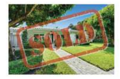
10525 NE 2 CT