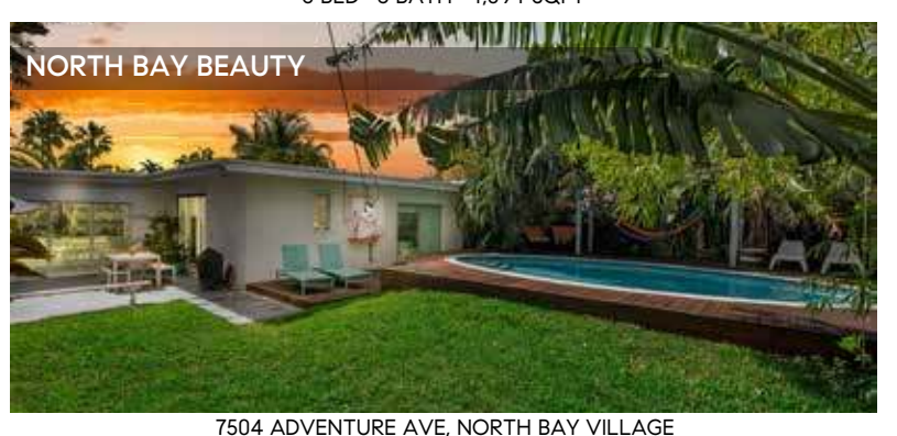
3 BED · 3 BATH · 2,000 SQFT

OVER $90 MILLION IN SALES LISTINGS ARE SELLING IN LESS THAN A WEEK, AT AN AVERAGE OF 96% OF ASKING PRICE VAST BUYER CONTACTS MARKETING POWERHOUSE STRONG WORK ETHIC