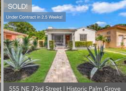
Sold @ $570,000