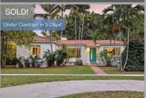
148 NW 97th Street | Miami Shores Sold @ $755,000