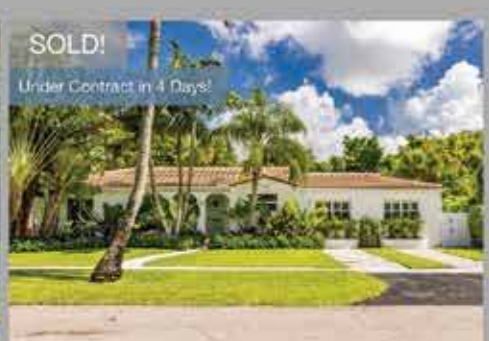
70 NE 99th Street | Miami Shores Sold @ $1,250,000