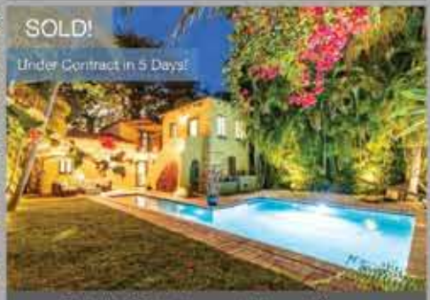
76 NW 97th Street | Miami Shores Sold @ $875,000