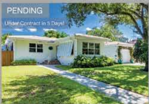
656 NE 120th Street | Biscayne Park Offered @ $749,000