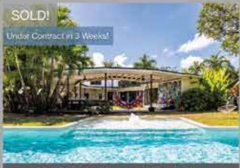
500 NE 96th Street | Miami Shores Sold @ $2,500,000